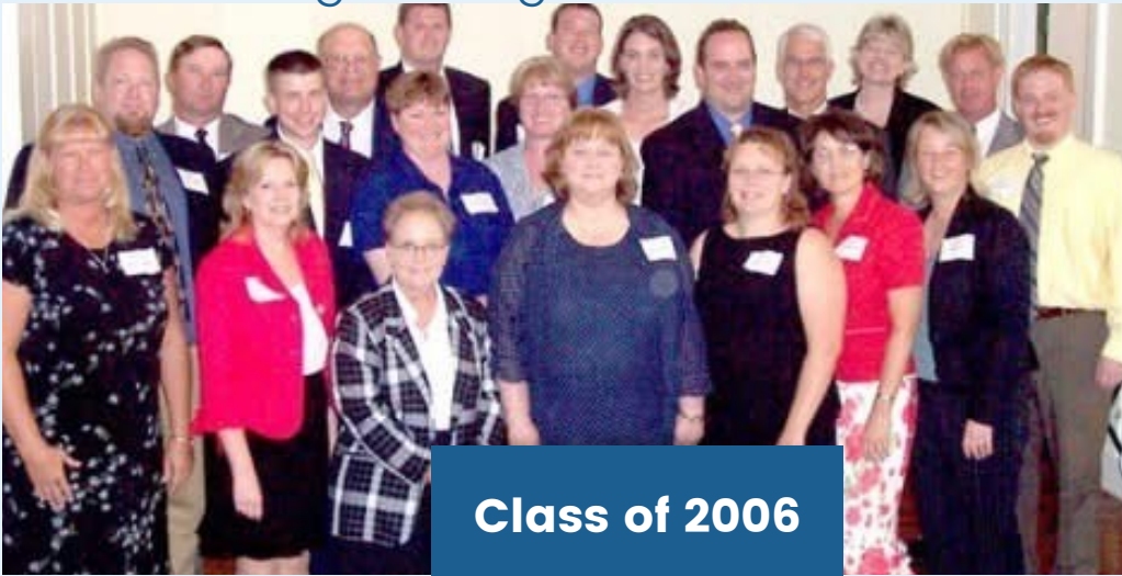
Class of 2006

Thank you to everyone who participated, shared, and gave in celebration of 25 years of Leadership Northwest—and to those who continue to believe in our mission. A special shoutout to the class of 2006 for having the largest number of donations in our campaign!